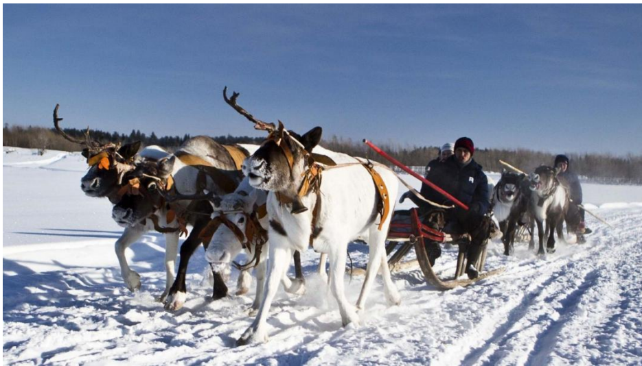
Figure 4 A Russian Arctic reindeer sleigh.

for men, women, children, and freight. Each reindeer sled has a specially trained lead reindeer, which leads a team of four to six reindeer. All items, household appliances, clothes, tent poles, and tires are packed on sleighs, and a large nomadic family may have more than 10 sleds (Loginov, 2014).