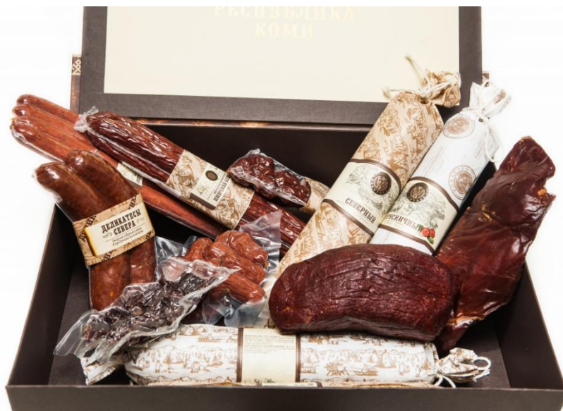
Figure 2 Russian Arctic reindeer-based foodstuffs.

In the harsh living environment of the north, tundra reindeer people need to maintain their energy balance. Proteins and fats in the body function to provide energy, regulate temperature and hormones, and protect the heart. A lack of sufficient nutrients can lead to metabolic imbalance, and long-term stress requires psychological protection. Because northern residents have shifted to eating food shipped from middle latitudes or other countries, there has been a significant increase in the incidence of malnutrition.