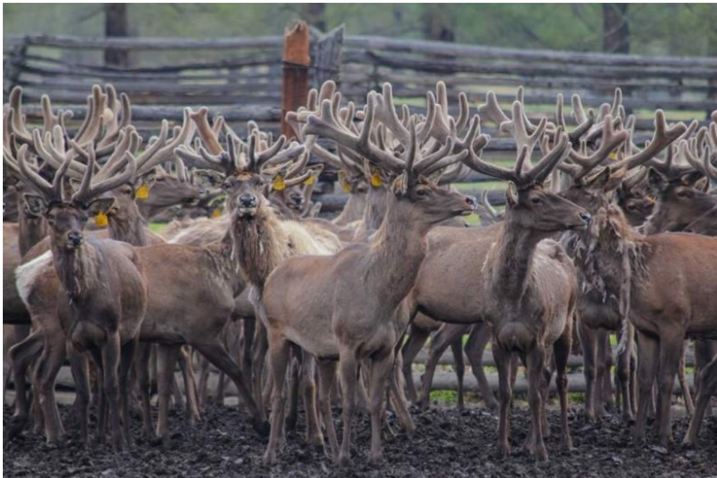
Figure 1 Reindeer: the basis of Russian Arctic life.

The reindeer industry originated in Russia and is said to have begun among the Saami and Tungusic peoples in the Altai-Saryan Highlands, and spread from there to northern Eurasia, including Scandinavia, and the northern territories of China and Mongolia. In the Western Hemisphere, the first reindeer did not appear until 1892, in Alaska. According to archaeological records, tundra reindeer grazing has a history of more than 2000 years in the Russian Arctic (Kharinskiy, 2009; Figure 1).