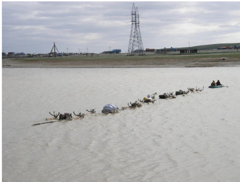
Figure 6 Effects of industrial development on reindeer migration in Yamal, Russia (Naykanchina, 2012).

adversely affects 40% of the reindeer pastures and hunting grounds (Figure 6). Every new oil or gas extraction facility and pipeline forces reindeer herders to change their grazing sites. Almost all 103 Nenets and Komi surveyed in 2008 reported that the presence of industrial facilities had damaged the quality of pastures, hunting areas, and fisheries, and had negative effects on berries and other wild plants. The vegetation cover in the tundra will not recover for 50 years (Degteva and Nellemann, 2013).