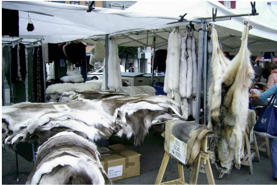
Figure 3 Arctic reindeer fur products.

not solitary nomads, but rather nomadize with their families. Thus, the younger generation traditionally learned the skills of living a nomadic life by accompanying the herders. They use reindeer-pulled sleds, which are installed with skis during the winter months and wheels in the summer months. There are several types of sleds, including those designed